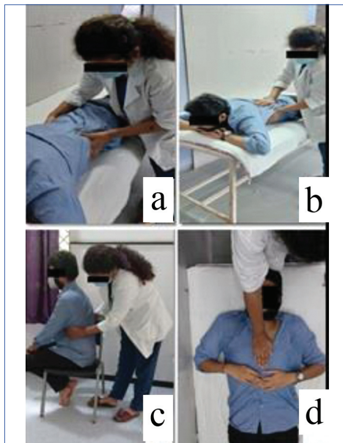
[Table/Fig-1]: a) Diaphragm release using postisometric relaxation and reciprocal inhibition; b) Muscle energy technique for lower rib cage; c) Diaphragm PNF d) Sternal pump.

Diaphragm PNF: Therapist placed their hands on both sides of the lateral aspects of the lower rib cage and applied a slight resistance with both hands while the patient breathed into the therapist's hands for 3-5 breath cycles [Table/Fig-1c,d] [16].